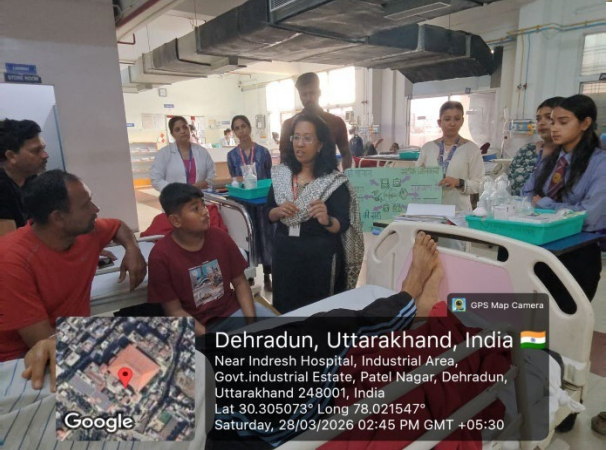
Dehradun, Uttarakhand, India Near Indresh Hospital, Industrial Area, Govt. Industrial Estate, Patel Nagar, Dehradun, Uttarakhand 248001, India Lat 30.305073° Long 78.021547° Saturday, 28/03/2026 02:45 PM GMT +05:30