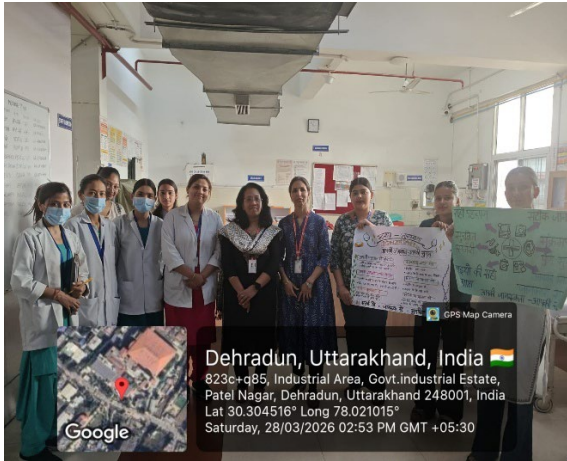
Dehradun, Uttarakhand, India 823c+q85, Industrial Area, Govt. Industrial Estate, Patel Nagar, Dehradun, Uttarakhand 248001, India Lat 30.304516° Long 78.021015° Saturday, 28/03/2026 02:53 PM GMT +05:30