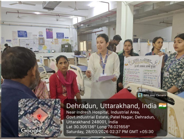
Dehradun, Uttarakhand, India Near Indresh Hospital, Industrial Area, Govt. Industrial Estate, Patel Nagar, Dehradun, Uttarakhand 248001, India Lat 30.305136° Long 78.021658° Saturday, 28/03/2026 02:37 PM GMT +05:30