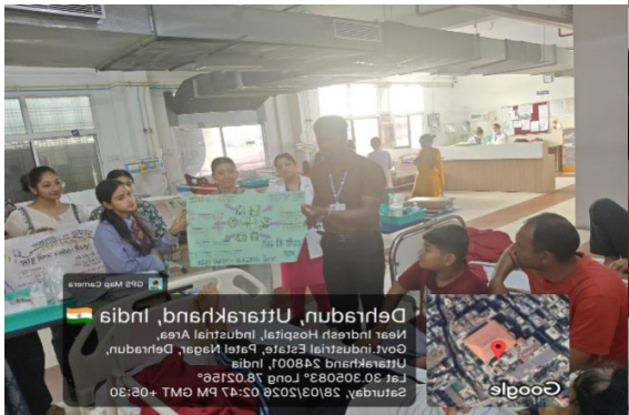
Dehradun, Uttarakhand, India Near Indresh Hospital, Industrial Area, Govt. Industrial Estate, Patel Nagar, Dehradun, Uttarakhand 248001, India Lat 30.305083° Long 78.02156° Saturday, 28/03/2026 02:44 PM GMT +05:30