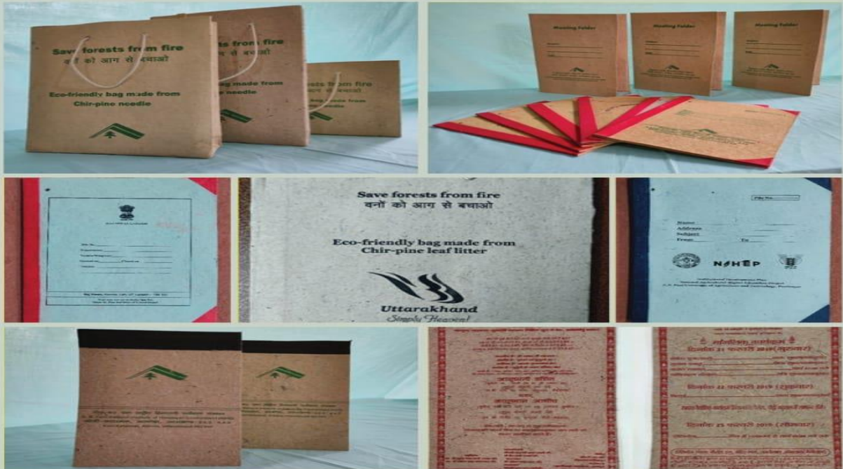
चीड़ पाइन प्रसंस्करण इकाई में पिरुल द्वारा बने विभिन्न उत्पाद Various Products Made of Pirul at Pine Processing Unit