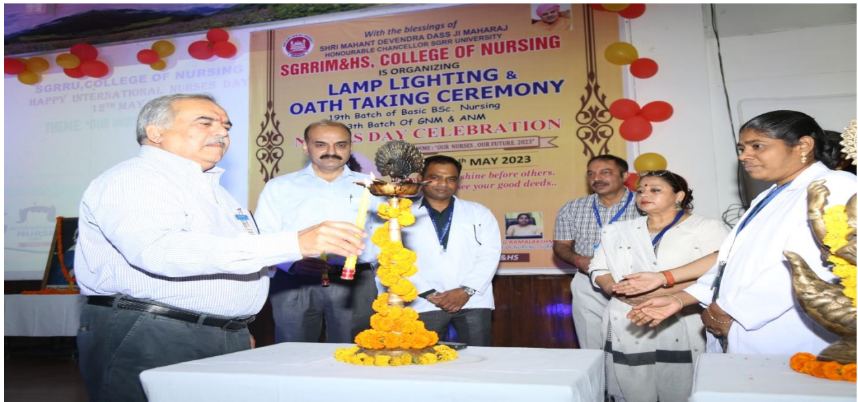
GUESTS LIGHTING THE LAMP