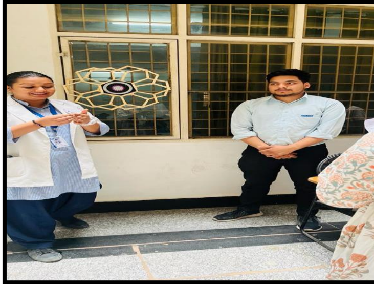
BEST OUT OF WASTE