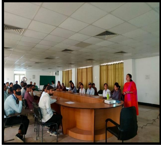
BRAIN DRAIN “QUIZ “ COMPETITION