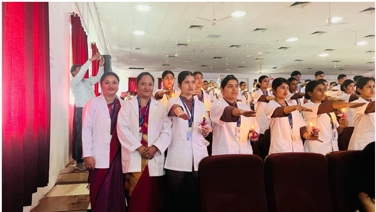
AS STUDENT NURSES PLEDGE “THE NIGHTINGALE OATH”