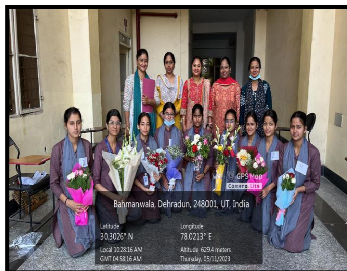
BOUQUET MAKING COMPETITION