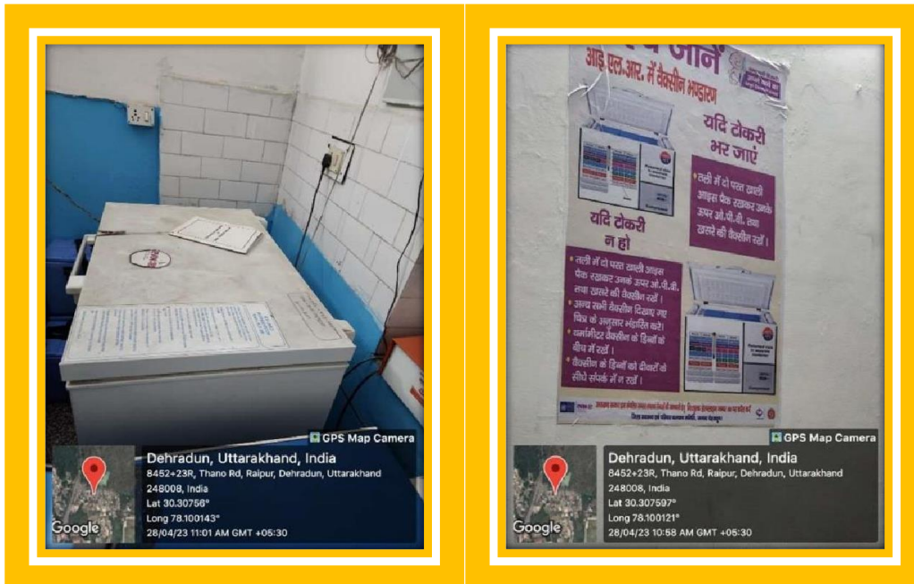
Cold chamber room